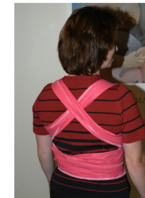
Figure 10. Straps crossed in back.