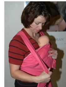
Figure 11. Position infant.