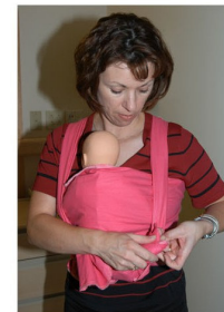
Figure 13. Tie other top strap to bottom strap.