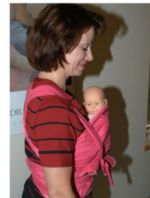
Figure 15. Center piece properly positioned beneath infant's ear.