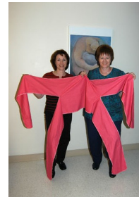
Figure 4. The KMC wrap.

The thari is made out of Polyester-cotton materiaal. It can be machine-washed and tumble dried. Ironing – medium steam setting.