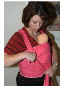
Figure 12. Tie top strap to bottom strap using square knot.