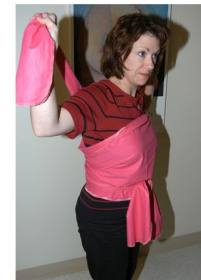
Figure 9. Cross straps and bring over shoulders.